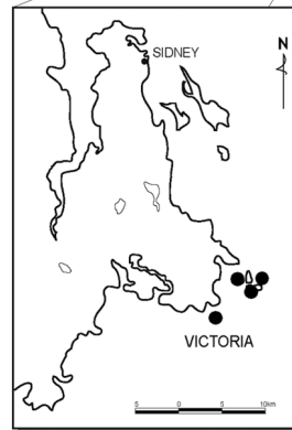
Distribution of Ranunculus californicus var. cuneatus