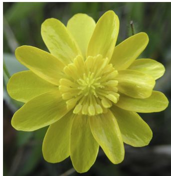
Ranunculus californicus var. cuneatus

Although a number of varieties of California buttercup have been described in Oregon and California, only variety cuneatus occurs in British Columbia. California buttercup can hybridize with western buttercup, producing intermediate forms that can be difficult to identify. Although the number of petals is highly variable, California buttercup usually has 9-17 petals that are 3 times as long as they are wide whereas western buttercup usually has 5 petals that are barely twice as long as they are wide. California buttercup has achenes with sharply curved, short beaks (0.1-1 mm) whereas western buttercup has achenes with barely curved, longer beaks (0.7-2 mm). The styles of California buttercup flowers are shorter (0.5-1.0 mm) than western buttercup (1.5-2.0 mm).