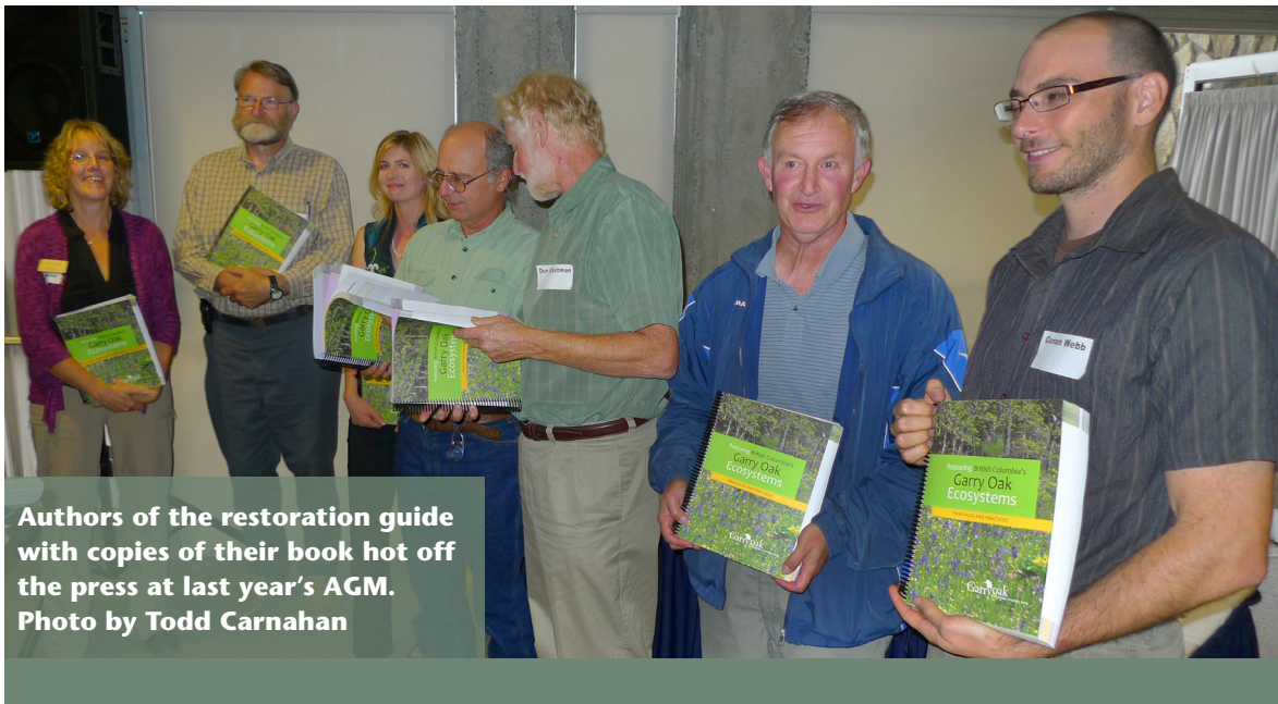
Authors of the restoration guide with copies of their book hot off the press at last year's AGM.