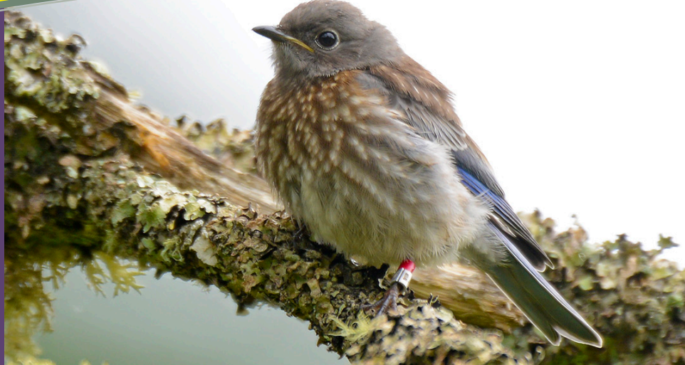
Juvenile Western Bluebird at Cowichan Garry Oak Preserve, spring 2012.

In 2011-12, more than 80 individuals contributed their time and expertise to the Recovery Team or one of its working groups.