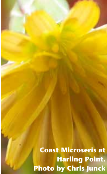
Coast Microseris at Harling Point.