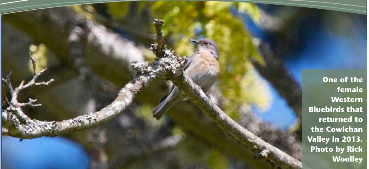
One of the female Western Bluebirds that returned to the Cowichan Valley in 2013.

Like an ecosystem, GOERT functions through relationships. Thanks to the dedicated work of individuals from the community, non-profit groups, businesses, and all levels of government, we have achieved many goals which allow us to protect Garry Oak ecosystems and species at risk for the future.